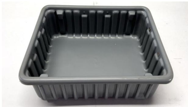
(TMB 2-5 Overhead)