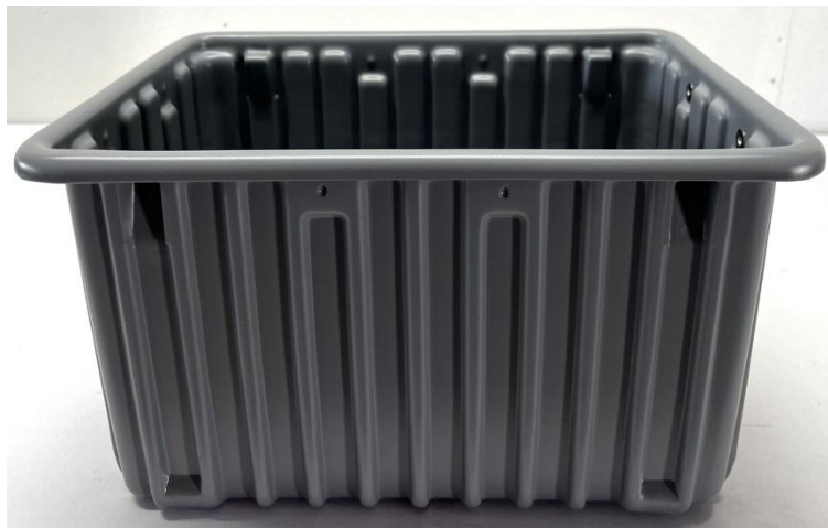
(TMB 2-8 Low-Angle)