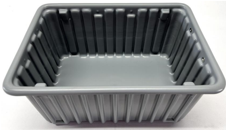
(TMB 2-8 Overhead)