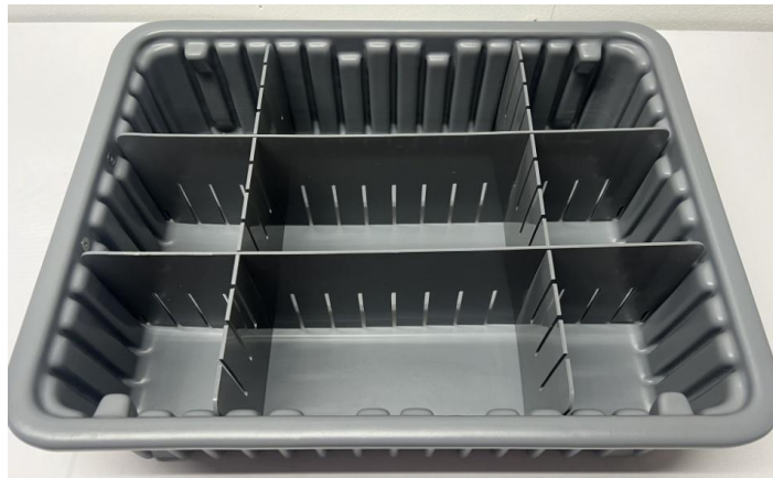
(TMB 3-6 HD Overhead) *Dividers sold separately*