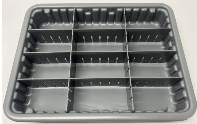
(TMB 3-3.5 HD Overhead) *Dividers sold separately*