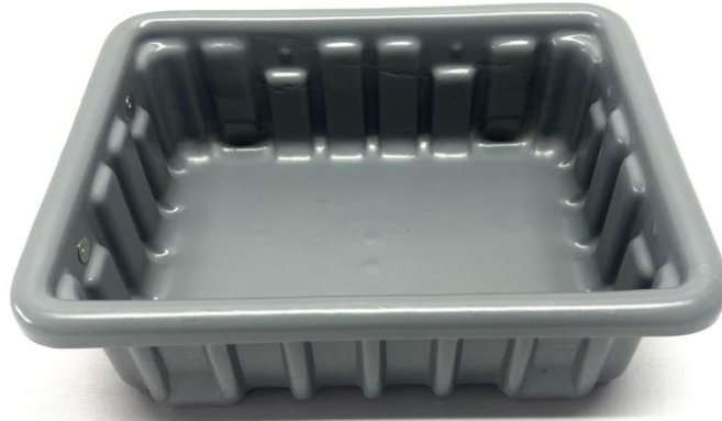
(TMB 1-3 Overhead)