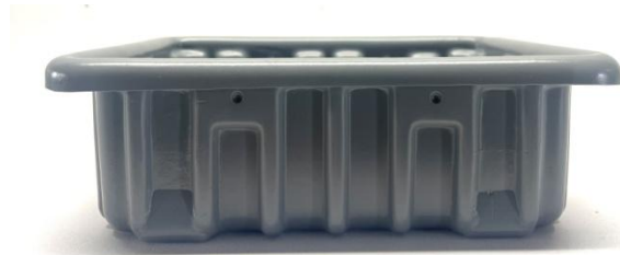
(TMB 1-3 Low-Angle)