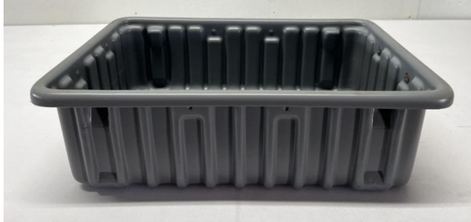
(TMB 2-5 Low-Angle)